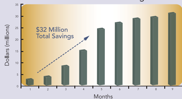
Cumulative Cost Savings